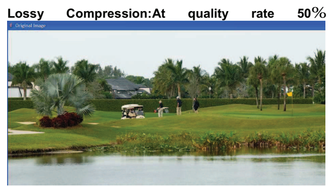
Fig 3. Lossy Compression applied to the original image

Wavelet Compression : At quality rate 50%