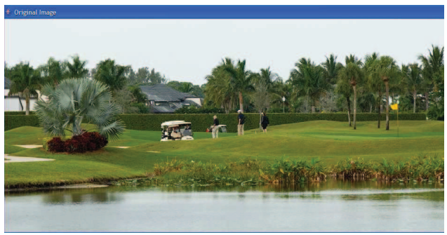
Fig 2. Lossless Compression applied to the original image